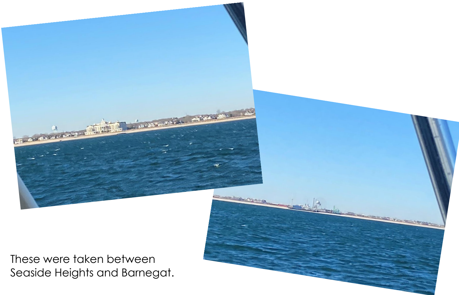
These were taken between Seaside Heights and Barnegat.

Turned the camera on to try and record but the sun's reflection off the water made it hard to see.