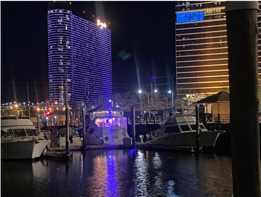
View from the boat.