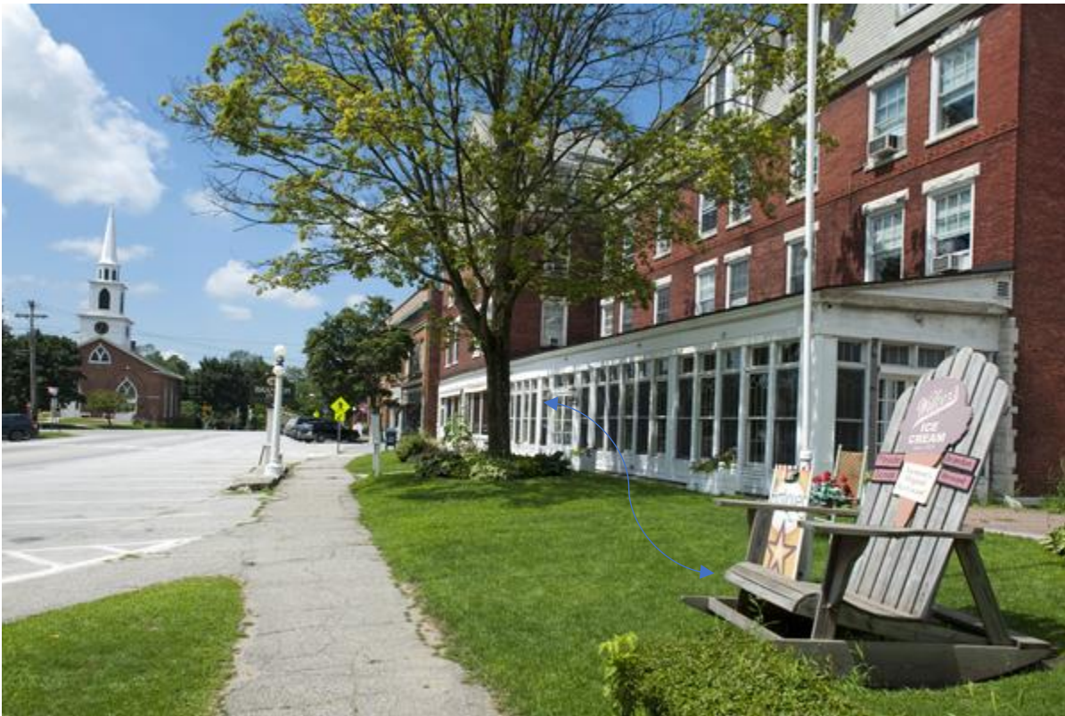
This photo is from the vermontvacation website I noted on the previous page.