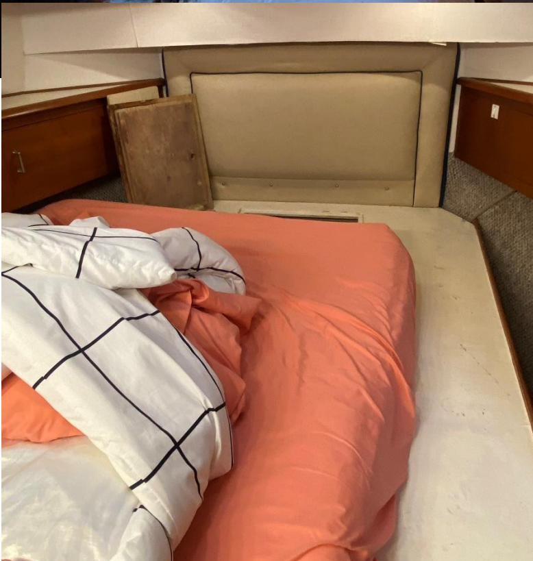
You have seen this scene before! This is the access to the bow's bilge.