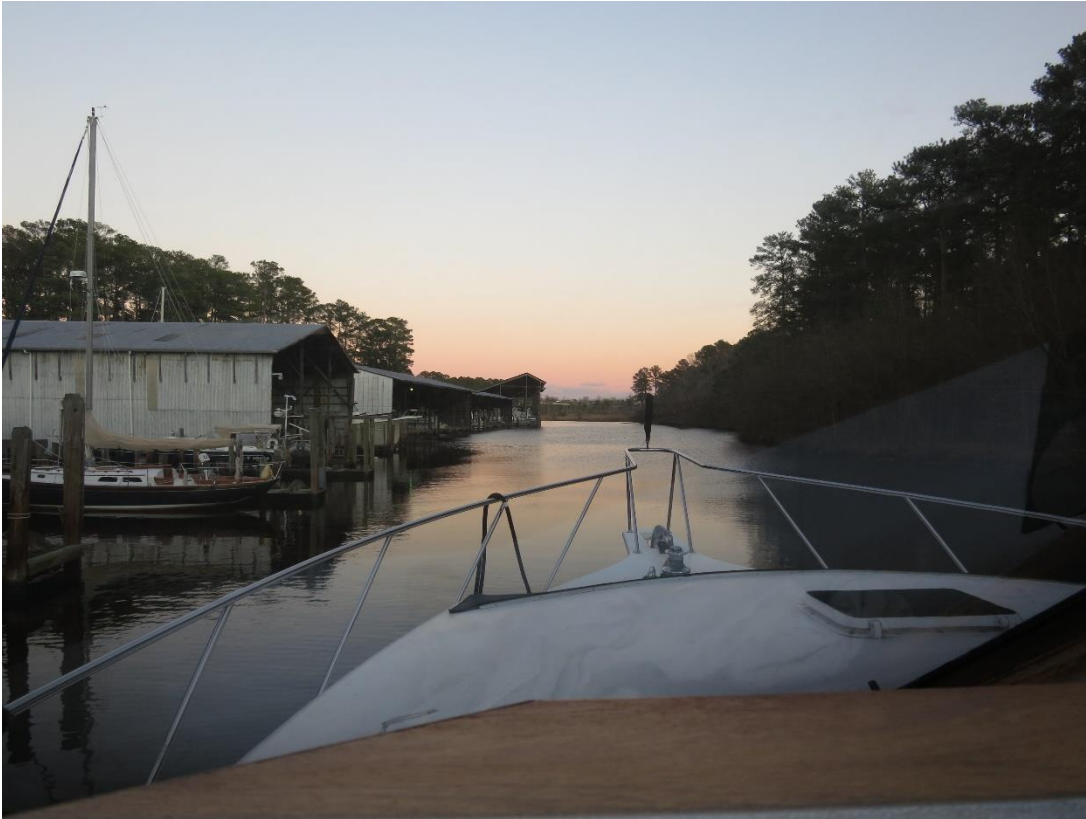
Leaving the back of the marina's lift dock.

It was offered that we could stay tied up at the dock right there next to the lift. We did decide to move back to our original dock location after tripping a breaker using that dock's electric pedestal.