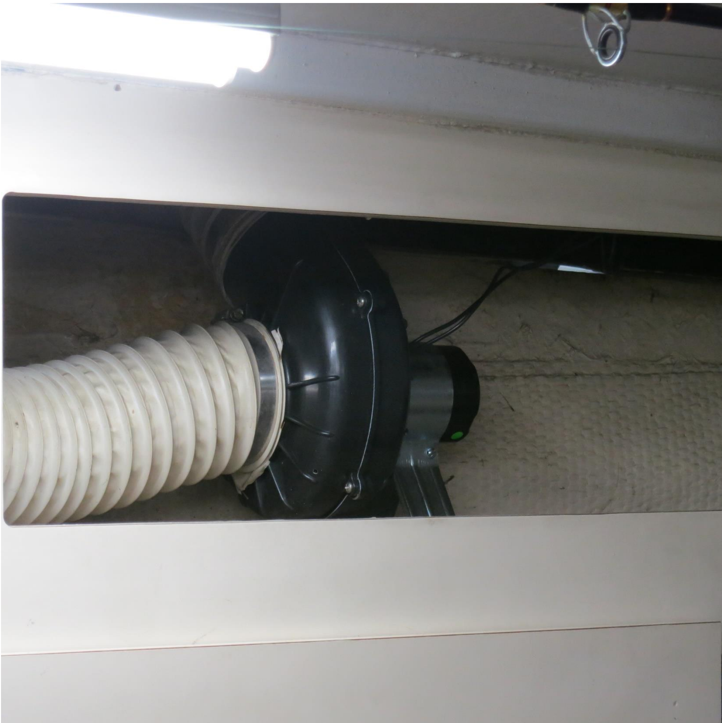
...A new exhaust fan.