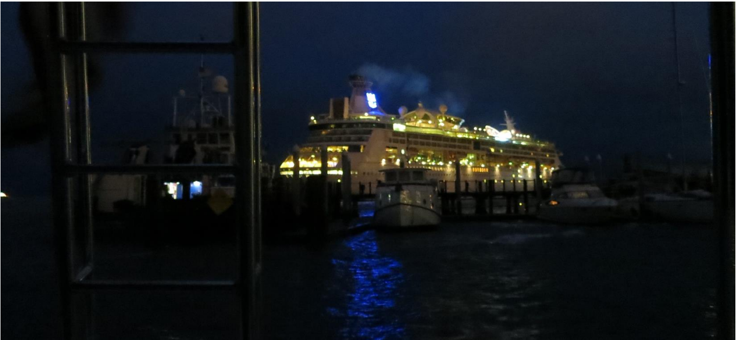
This Carnival cruise ship is docking at Union Pier. Just next door to our marina. These were taken this morning around 7 a.m.