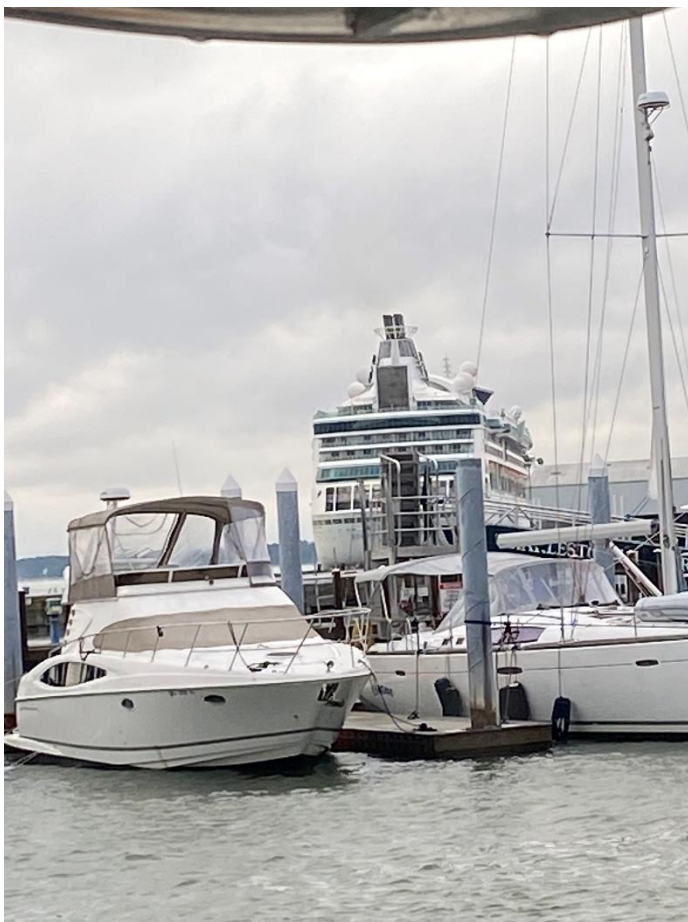
This one here was taken around 8:30 a.m.