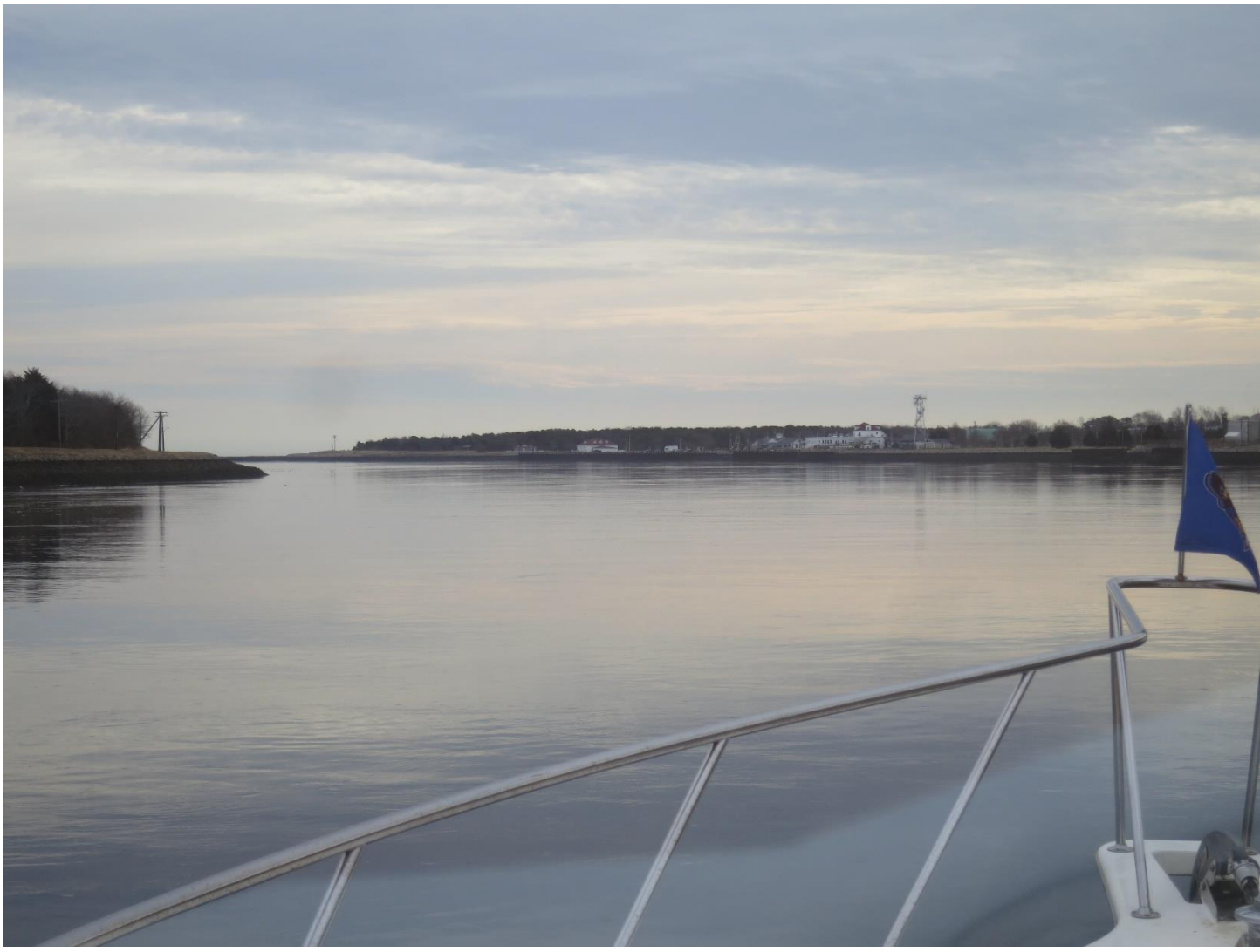
Approaching Town of Sandwich Marina