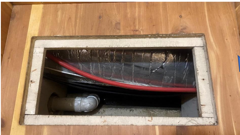
This is looking down into that space. The hose runs through here.