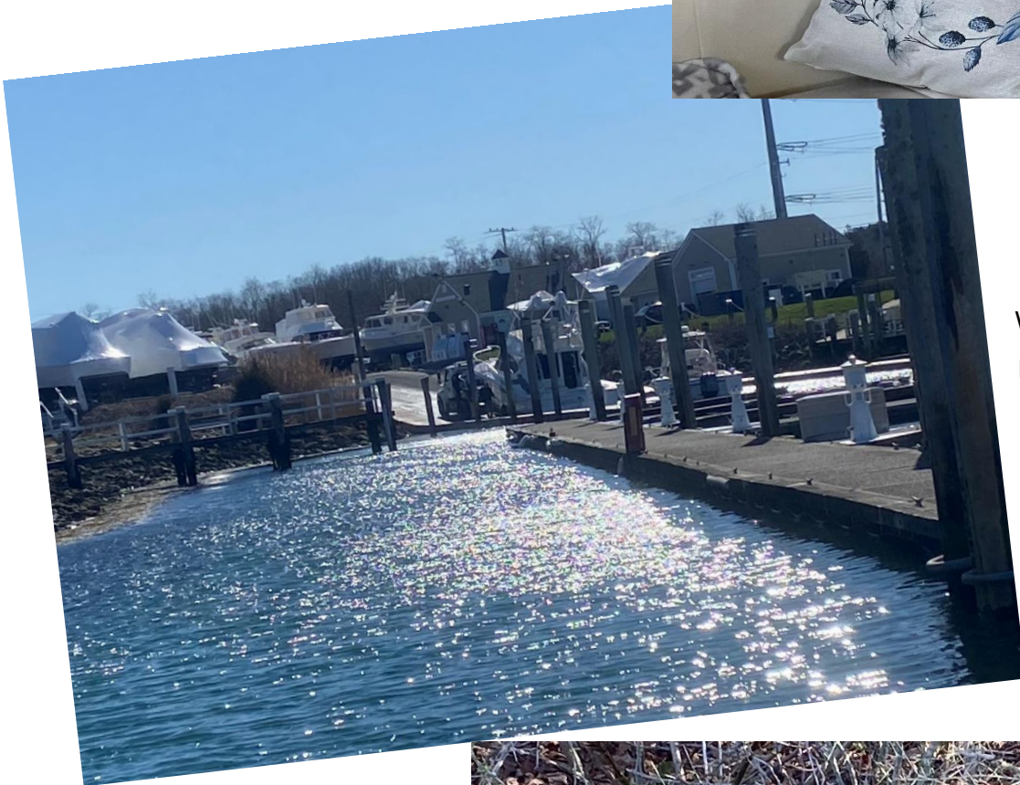
We have 3- new neighboring boats along our dock