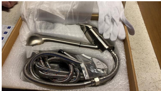
In with the NEW