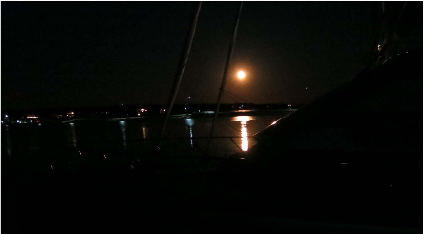
June 14, 2022-Strawberry Full Moon from Valkyrie