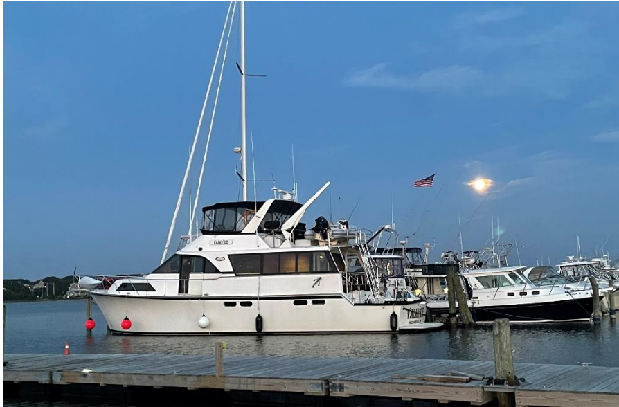
June 13, 2022-Valkyrie