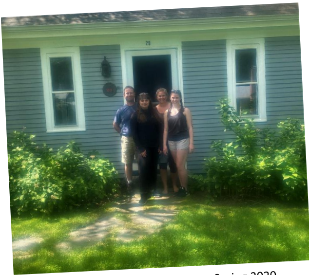
Family photo in front of our house. Spring 2020.

We are living our dream and we welcome you to our story!