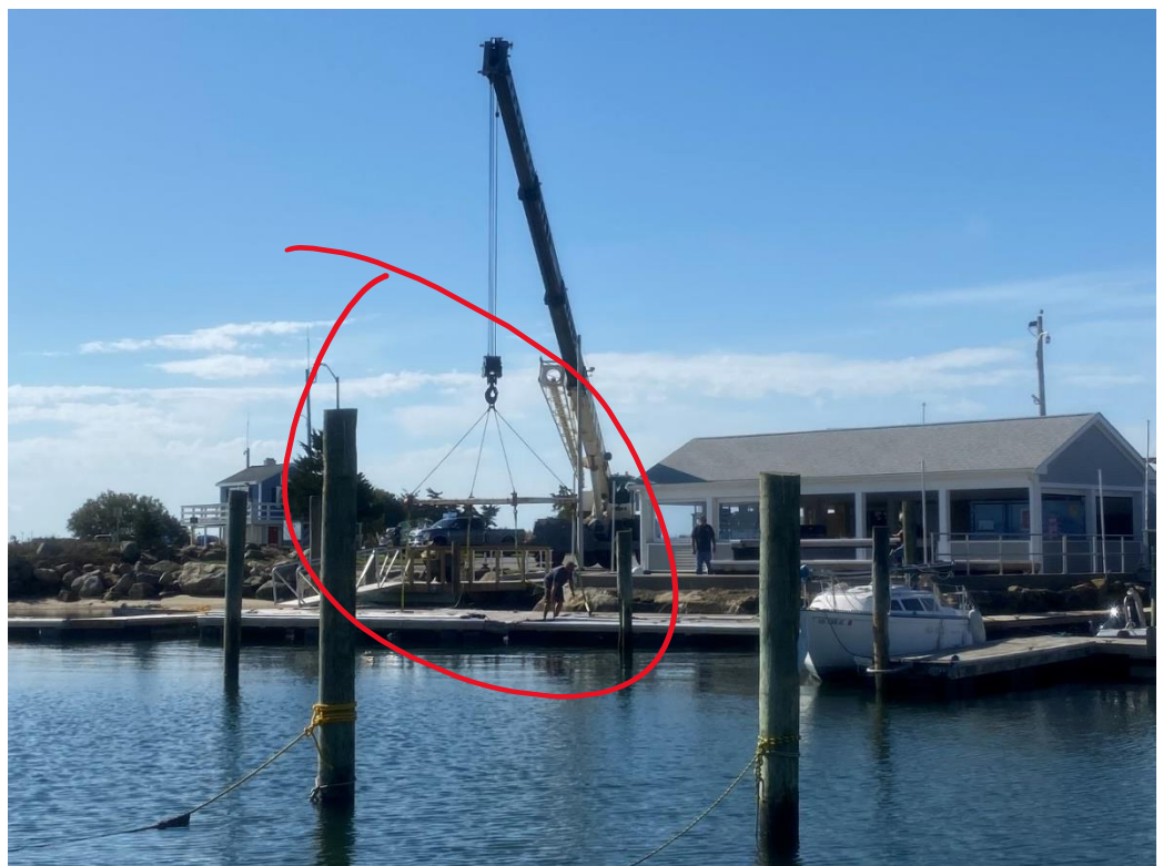
Using the crane to haul the docks!

Before they can haul the docks they have to pull the electric and water lines.