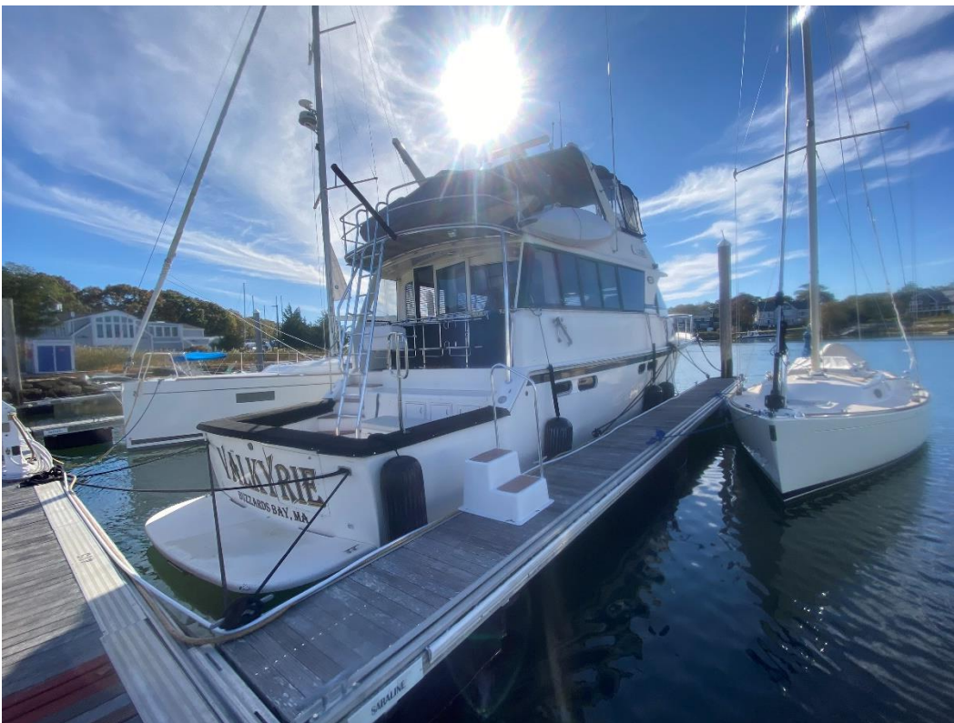
Valkyrie's winter slip.

The arrival day to Fiddlers was amazing. It could not have gone any smoother.