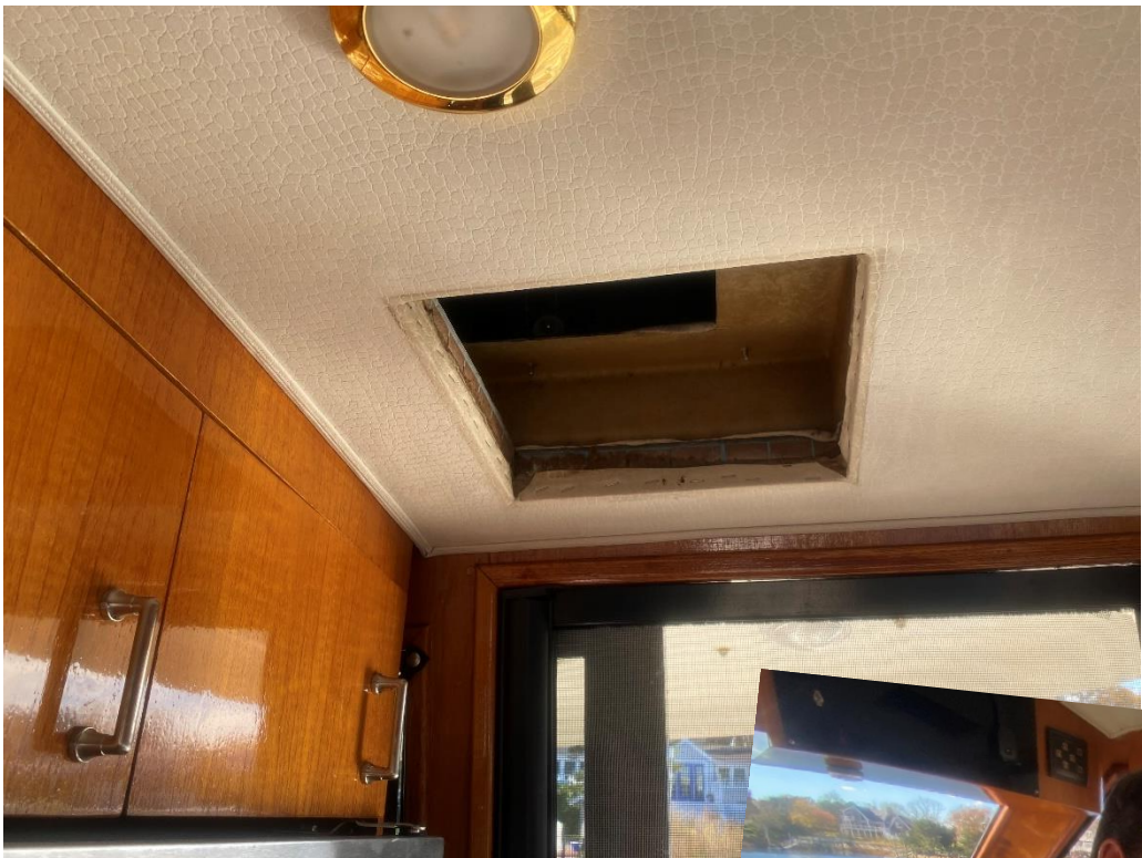
Valkyrie's galley vent.