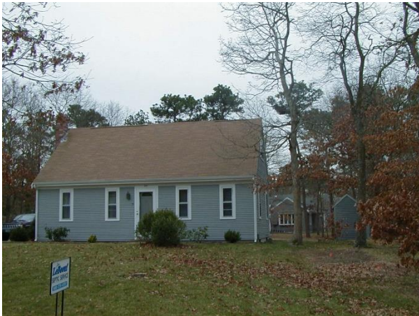
March 2002, the day we bought the house.

And, the thought of organizing, packing, selling, and donating 18 years of accumulated stuff is very daunting!