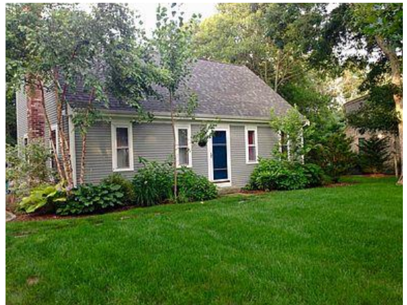
The listing photo. 2020

I tried making every argument I could come up with to keep from selling the house. Ultimately it comes down to this one statement.