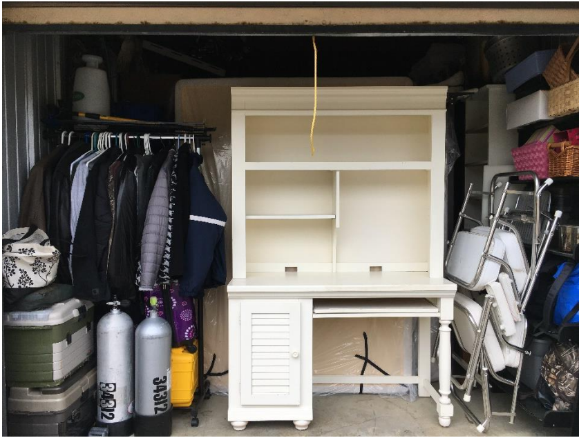
Our storage unit! At one point we had 2.