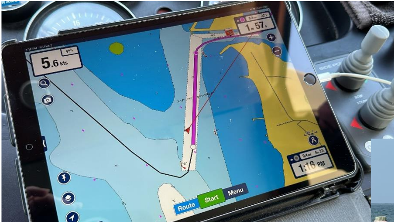
The channel coming into Ocracoke, NC

Banks. The 2020 the census was 797 residents. Its economy is dependent on tourism and fishing.