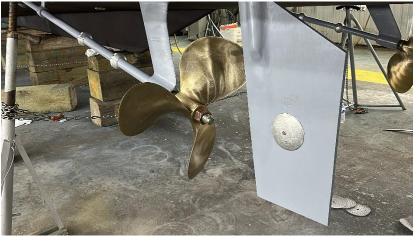
New props, new zincs, and primed.

The new nuts for the propellers were installed. The workers break at 10 am, and 2 pm with lunch at noon. I have been trying to take video updates during their break times.