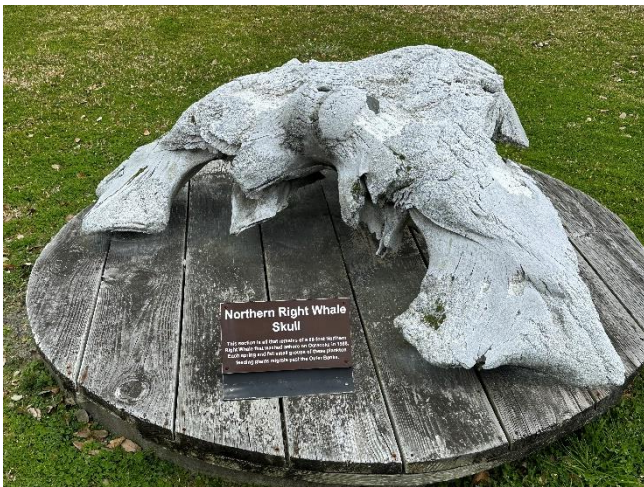
On display outside the National Park Service building. (NPS)

We hope that the winds will die down so we can leave in the morning. Mark has several plans in mind for anchorages so if we decide to leave we have options to ditch out of the sound if the waves are too much.