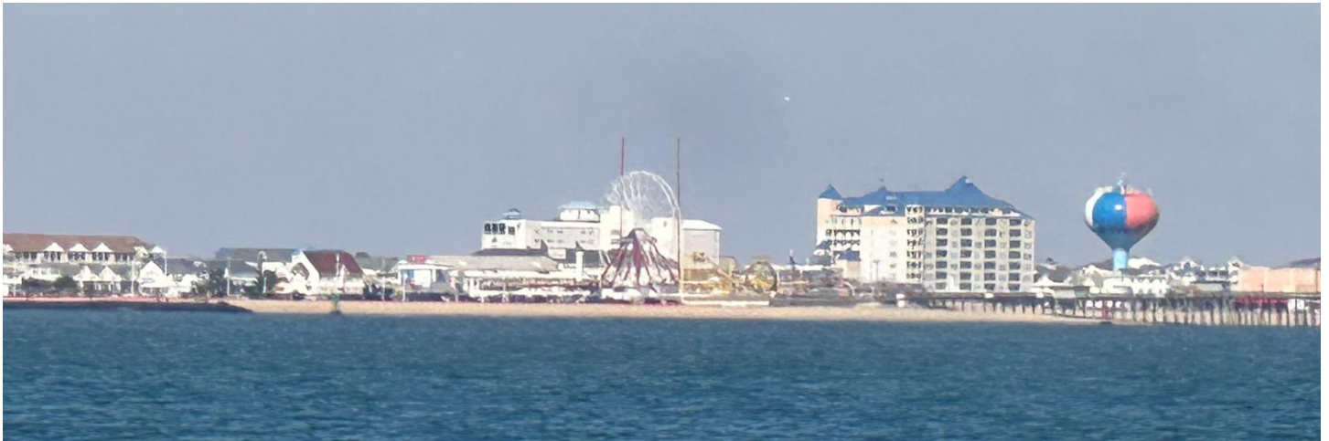
Ocean City, MD