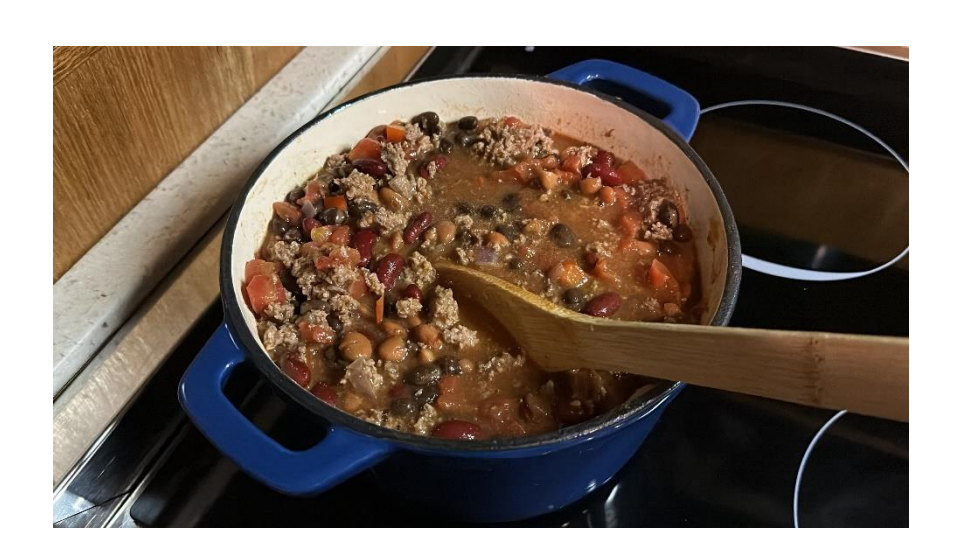
Day 91 – Thursday, February 29, 2024 – Newport, RI

We made chili for dinner. We like to top off our chili with cheddar cheese, sour cream, and Fritos.