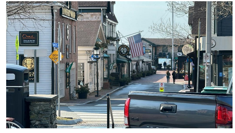
Walking down America's Cup Ave towards Bowen's Wharf