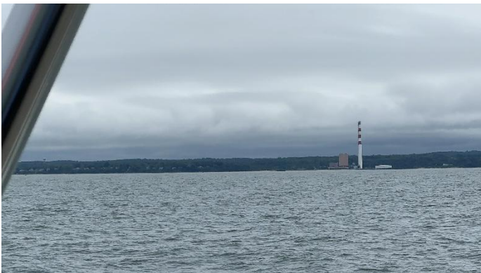
The view of the stacks from LIS Vs

The Northport Power Station, known as “the stacks” by locals is the largest power generation facility on Long Island. It is a natural gas and conventional oil electric generating station. Since 2007 it has been owned by National Grid. In 2010 National Grid filed a lawsuit against the station's property tax levy which was the most taxed building in the US at $80 million. The stacks are 620' tall.