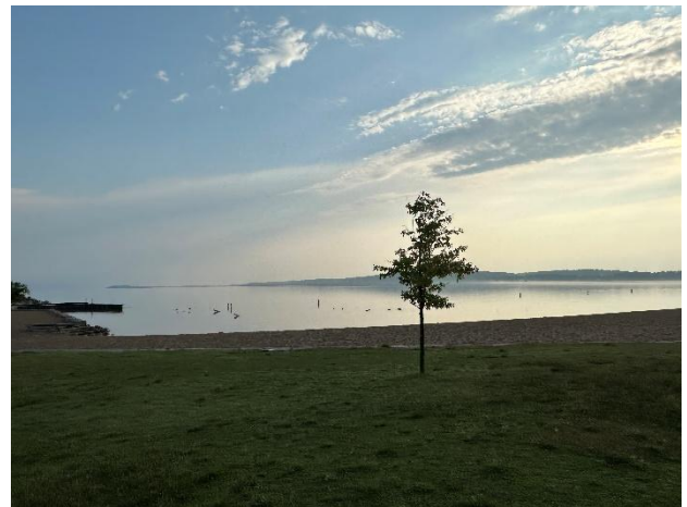
Looking out into Grand Traverse Bay