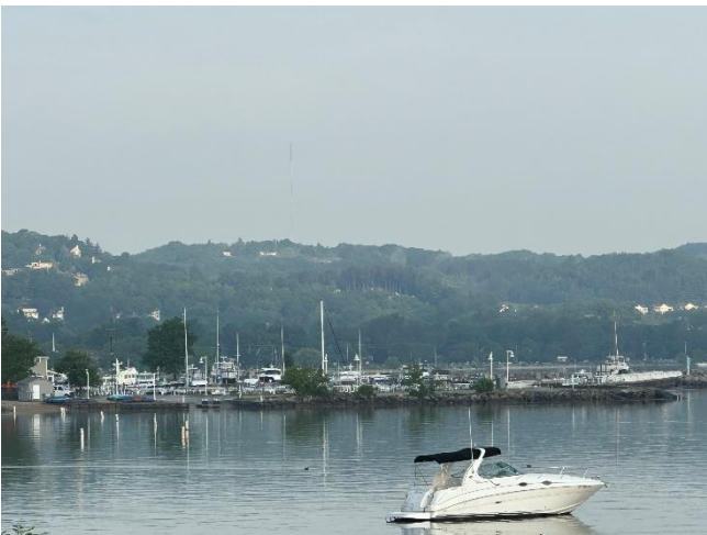
Looking back towards the marina from the recreation trail