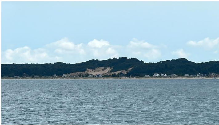
Our view at Cat Head Bay