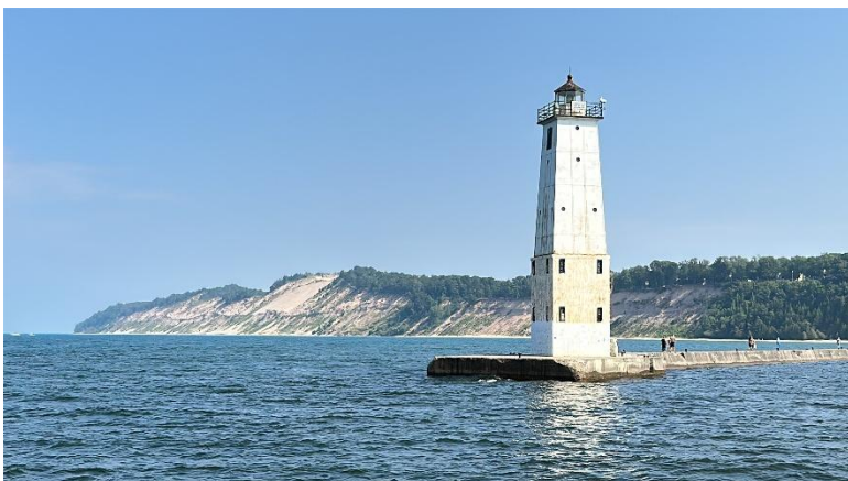
Frankfort lighthouse as we left the harbor and turned south.